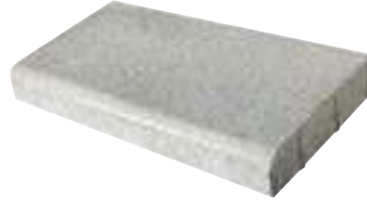
FULLNOSE 14 x 24 x 2⅝" 360 x 600 x 60mm