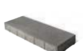
8 x 24 x 2 3/4" 200 x 600 x 70mm