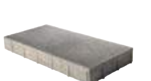
12 x 24 x 2 3/4" 300 x 600 x 70mm