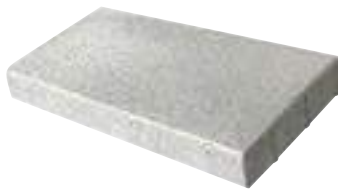
CHAMFERED 14 x 24 x 2⅝" 360 x 600 x 60mm