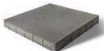
24 x 24 x 2 3/4" 600 x 600 x 70mm