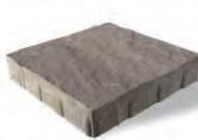
SQUARE 14 \frac{1}{16} x 14 \frac{1}{16} x 2 \frac{3}{4} " 360 x 360 x 70mm