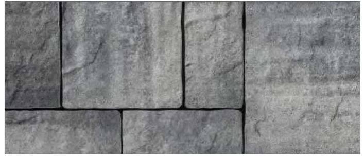
GRANITE BLEND NEW