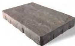
LARGE RECTANGLE 14 \frac{1}{16} x 21 \frac{1}{4} x 2 \frac{3}{4} " 360 x 540 x 70mm