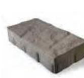
SMALL RECTANGLE 7 \frac{1}{8} x 14 \frac{1}{16} x 2 \frac{3}{4} " 180 x 360 x 70mm NEW