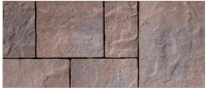
MAHOGANY WHILE QTY'S LAST