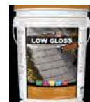
Gator Hybrid Low Gloss + Colour Enhancer