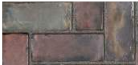
HERITAGE 2 COLOR BLEND BLENDED ON SITE