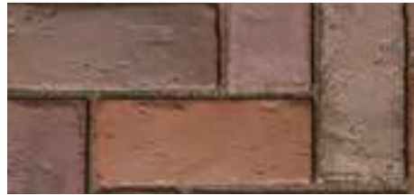
3 COLOR BLEND BLENDED ON SITE