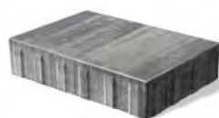
LARGE RECTANGLE 8 7 / 8 x 13 1 / 2 x 3 1 / 8 " 226 x 343 x 80mm